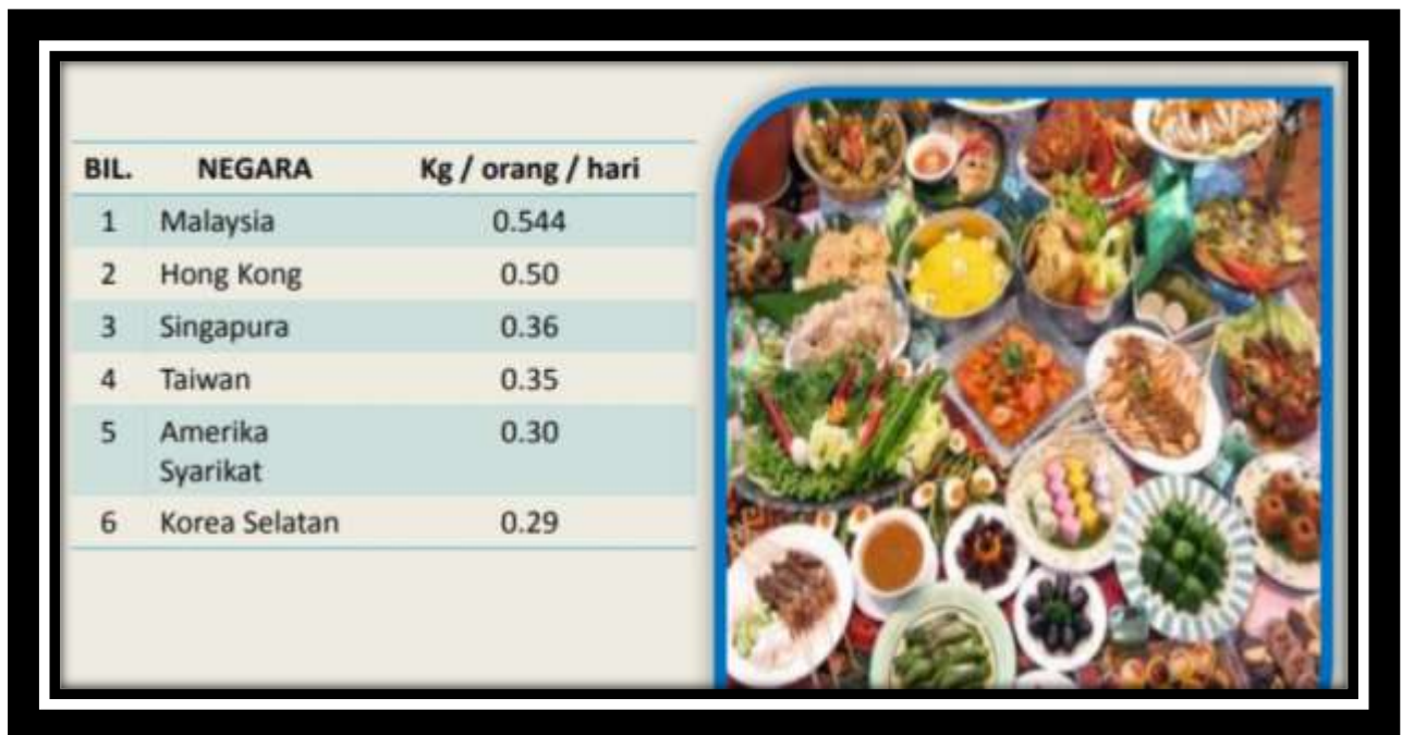
Figure 2: A statistic by SWCorp Malaysia in showing the comparison of food waste by countries.

Malaysia alone, the statistics shows said that we are losing 28.5% from the harvested rice costs of RM918 million. Meanwhile, we are losing about 20%-50% of harvested fruits and vegetables during the process of food management.