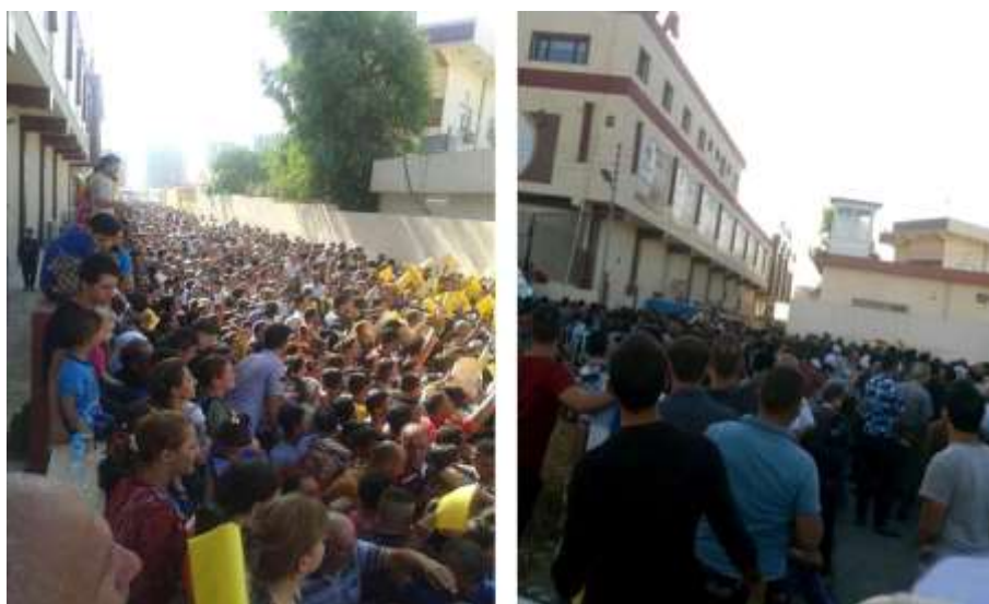
Figure 1: Congestion near the passport offices in northern Iraq (Matthew, 2014)

The majority of the services required by the IDPs provided in the Iraqi e-services portal and Ministries' web pages – these include e-Passport, e-License, e-Fines, e-Birth Certificates and e-Death Certificates (Iraq Electronic Services, 2016). For instance, there are huge congestions on the passport offices made by the displaced citizens seeking to obtain passports (Al_Sabah, 2014; Dalshad, 2014). The number of people waiting outside the offices reaches the thousands a day, while the displaced can complete most of this transaction through the Iraqi G2C-ICT services (Iraq Electronic Services, 2016), this situation indicates to the unwillingness of IDPs to use ICT services provided by the Iraqi government. The two photograph presented in Figure 1 below give the reality picture of the straitened situation for Iraqi government offices in the host cities.