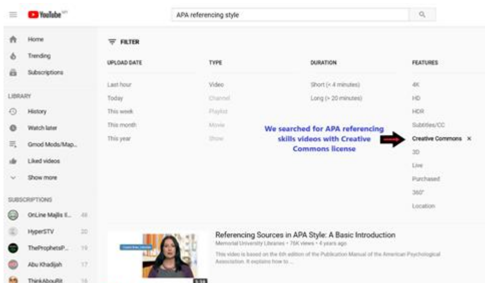
Figure 2: YouTube search on ‘APA referencing style’ filtered by creative commons license

In order to create the quiz questions, we used the software Articulate Quiz maker 13 . The software was chosen because of the wealth of question types that it offers with the added capability of calculating marks and giving grades to the quiz taker. In articulate Quiz maker, many types of questions could be designed such as multiple choice, true/false, multi response, fill in the blank, word bank, matching drag and drop, matching drag down, sequence drag and drop, sequence drop down, numeric, and hotspot. We took advantage of this robust capability of the Quiz maker software by creating many types of questions in our quizzes. Once our questions were created, we transformed them into SCORM packages to that they could be used by Moodle.