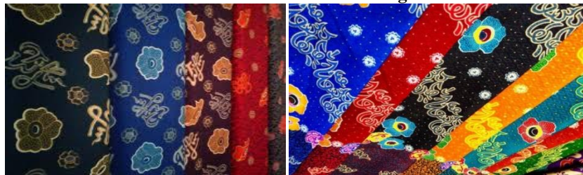
Gambar 1.1 Batik Besurek Bengkulu