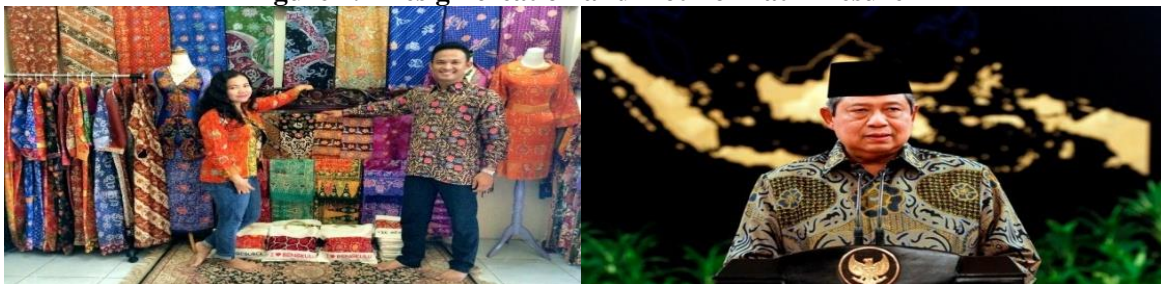
Figure 4.2 Design creation and motif of Batik Besurek

"After the event of Carnival Besurek Batik our turnover reaches Rp 5 million per day. Whereas normally Rp 1 million per day," said Kailan, owner of Rampak 1 on Jalan Soekarno Hatta