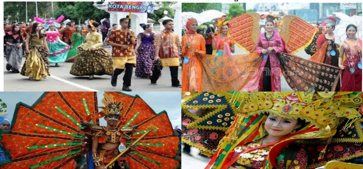
Figure 4.1 Carnival Batik Nusantara Bengkulu 2016