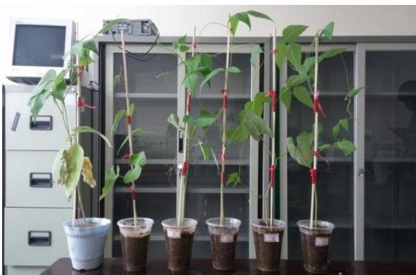
Figure 10: Exposure group

As a growth index, this paper uses the height of stems and lengths of leaves of kidney bean plants on test days; the results show that the EM field does not have a noticeable effect on the growth of kidney bean plants, as shown in Figure 9 and Figure 10.