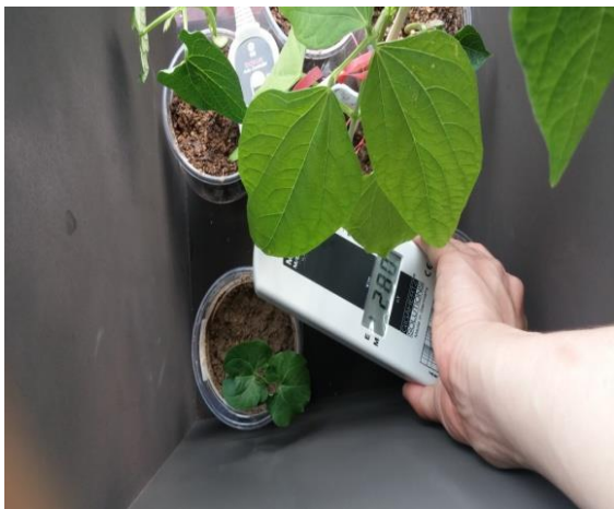
Figure 4: Field level in exposure case