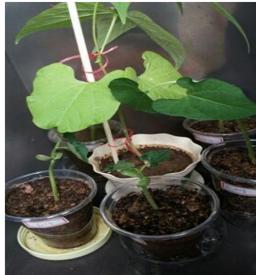
Figure 3: A stanchion for supporting

On average, the electric field in the exposure group was 320 V/m, whereas that in the non-exposure group was 10 V/m. At the same times (08:40, 14:00, and 20:30) each day, all pots were supplied with a maximum of 15 mL of water. Consistent with the growth pattern, to prevent the kidney bean plant stalks from falling, a stanchion (to which the plant is tied) is installed as shown in Figure 3.