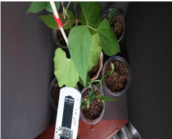
Figure 5: Field level in non-exposure case

The average of the field is roughly 8 V/m.