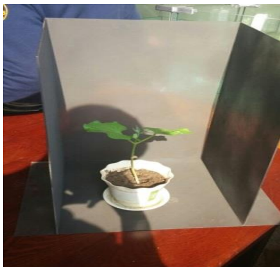
(b) Non-exposure to the electromagnetic waves