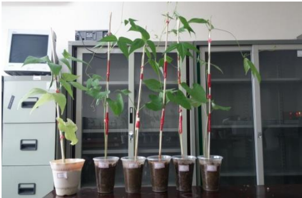
Figure 9: Non-exposure group

At the end of the test, the state of the leaves of the exposure group exhibits the withering phenomenon and the unexposed group shows good status, in terms of touch and the gloss of the leaves.