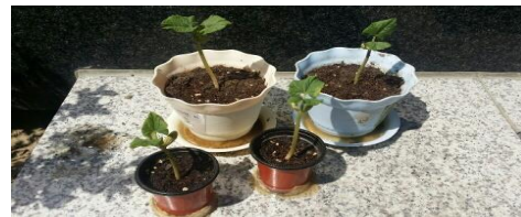
(b) Transplanting kidney beans to flowerpot