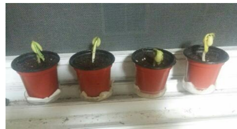
(a) Kidney beans germination

To ensure the plant grows well and the bean can be peeled gently, test kidney beans were placed in water and macerated. When germination starts, the kidney beans are moved and planted in pots to begin the population experiment. Two boxes (30 cm x 45 cm) were constructed using acrylic plates and their front and upper sides were removed to maintain a constant amount of sunshine (Figure 1).