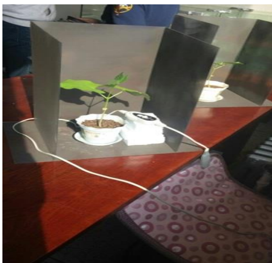
(a) Exposure to the electromagnetic wave

To establish different experimental conditions, a temperature control switch of the electric blanket (BKC-12 CS01, Bokuk, Korea) was placed on right side of the left box, at its center (for artificially generating the EM wave), as shown in Figure 2(a). From the other side of the box, all devices capable of generating an EM wave were removed from a 30-cm radius surrounding the box, to minimize the occurrence of EM waves, as shown in Figure 2(b).