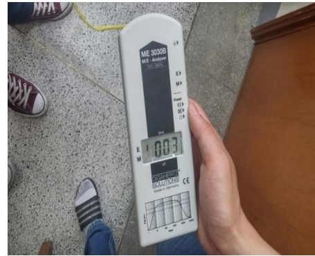
Figure 6: Field level in the test laboratory

Figure 7 shows the average height of the stem in each population (as a growth index) versus the measurement date. Initially, the height of the stem is 15.4 cm ± 0.3 cm; in the experiments, the plants grow quickly. As a result, the height of the stem between exposure and non-exposure cases shows a relatively small difference.