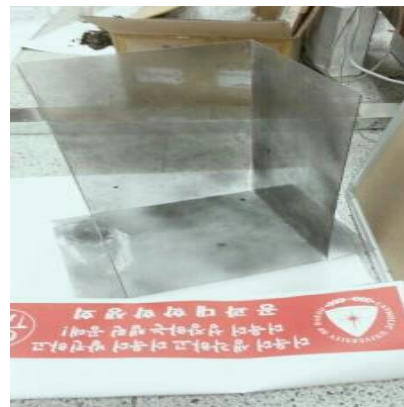
(c) Test box for a constant sunshine amount