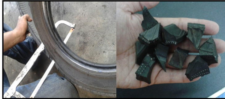
Figure 1: Preparation of rubber waste sample

Concrete mix designs must be taken into consideration in order to produce quality concrete. The ratio stipulated in the concrete mix is 1:2:4 by weight. A design based on the weight ratio was used to provide equality between aggregate gross weight and the weight of the tire rubber aggregate. The strength and durability of concrete depend on the materials and methods chosen with adequate mixing. By selecting the right mix proportion of concrete, the concrete workability can be achieved. Water-cement ratio adopted in this study was 0.5. The strength of the concrete mixing depends on water-cement ratio. To improve the quality of concrete workability, the water-cement ratio is reduced as much as possible. Mix designs for both groups are similar. A total of 3 samples were prepared in this experiment. For the mixing experiment, samples with rubber tire waste as a replacement for coarse aggregate were determined by weight method. The replacement was done with the addition of different percentages of 1, 3, and 5% by weight of rubber waste.