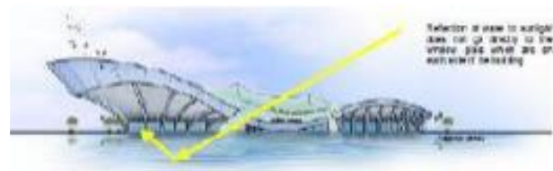
Figure 8 the reflection of light that comes from the pool, can enrich the light inside the room