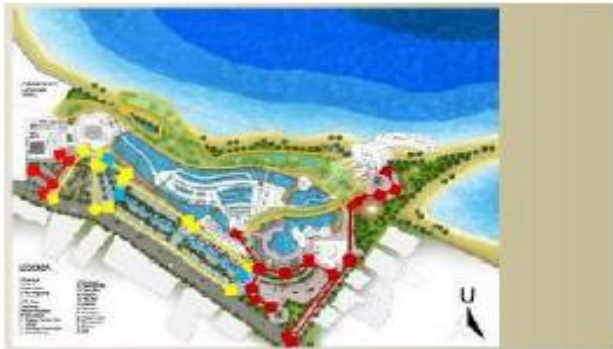
Figure 2 Access and circulation by function and achievement