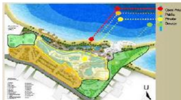
Figure 1 Patterns on the design of mass Sea World resembles a linear curve "S", as a form of application

biomorphic dynamic theme to the concept of wing movement stingray wavy curved "S". Patterns order mass is divided into three zones based on activity, namely; Public, Private and Semi Private. Border zone is characterized by differences in the flooring material used, so it will be easier for users to perform their activities. Private zone in the limit by providing a pool that surrounds the area, so it is not accessible to all visitors without tickets. Limits are designed to give the impression open but cannot be achieved easily. Building curved "S" become a point of interest layout plan and become circulation director aspects by following the movement of the linear pattern. While other buildings as a support, placed at a certain point in consideration aspects of service activities can be affordable. Basically site have a zone of land and sea zones, but to anticipate the negative sea air and seawater, then the placement of the building mass is placed in the zone of the land. In addition, the building located on the land area is expected to have ease of accessibility, while the area of beach / ocean used as an open area, so visitors can enjoy the atmosphere of the beach / ocean pristine which means the design principles do not damage the marine environment. Figure 1 shows the patterns on the design of mass Sea World resembles a linear curve "S", as a form of application