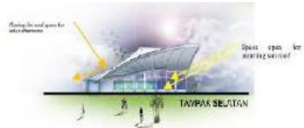
Figure 7 open roof shape oriented in natural light (east)

Figure 7 shows the open open roof shape oriented in natural light (east) and Figure 8 shows the reflection of light that comes from the pool, can enrich the light inside the room.