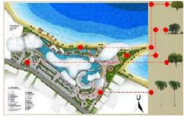
Figure 3 Vegetation is used as an air filter (acid) from the sea breeze

Site conditions that are in the coastal area of air causes the acid will damage building materials, the placement of vegetation as a barrier or filter air before entering the site and building, be an alternative to placement evenly on the beach. Figure 3 shows the vegetation is used as an air filter (acid) from the sea breeze