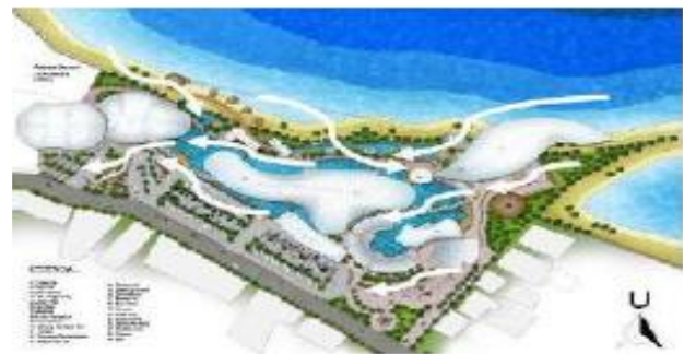
Figure 9 Arrangement of the building at the site, following the pattern of wind movement

Air circulation in the building was designed to use natural air circulation elements, like windows, vents, and void. This condition is reinforced by the existence of a pool that is capable of cooling the air in the room. For special enclosed space such as auditorium, using artificial air circulation (air conditioner) as well as on the first floor which is located in the basement and surrounded by fish ponds. Figure 9 shows the arrangement of the building at the site, following the pattern of wind movement. Figure 10 shows the air circulation in the building was designed to use natural air circulation elements