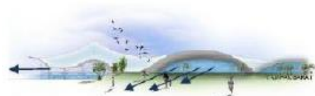
Figure 6 The glass material is installed to maximize the views from inside the building to the outside space