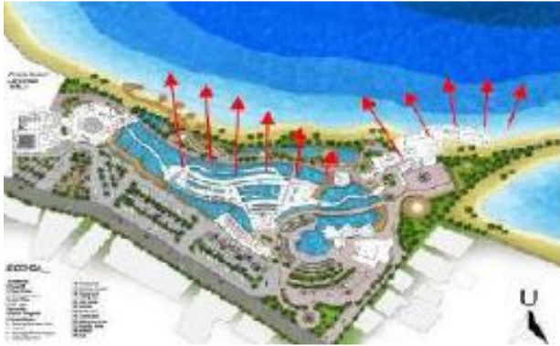
Figure 5 building and building arrangements oriented to sea

material will give the impression boundless (transparent), so visitors see the building as hovering over the pool to the sea. Figure 5 shows the building and building arrangements oriented to sea and Figure 6 shows the glass material is installed to maximize the views from inside the building to the outside space