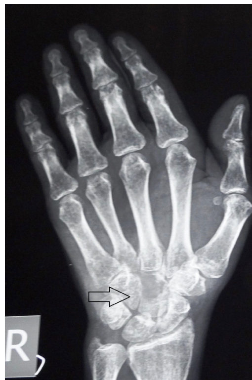
Figure 3: Radiograph of the right hand revealing a lytic lesion in capitate bone.