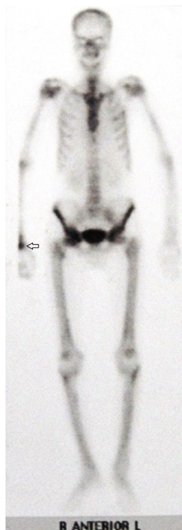
Figure 2: Bone Scan with Technetium 99m demonstrating uptake in in right wrist and head of right femur.

The mean duration of survival in patients with acrometastases is six months. Given the bleak prognosis of carpal metastatic disease in lung cancer, treatment of a metastasis to the hand is usually palliative and may involve amputation, simple excision or wide excision of the tumour in conjunction with other therapeutic modalities. Local radiotherapy often gives pain relief with good functional outcome and organ preservation. A recent report by Flynn et al. highlighted the role of palliative radiotherapy in pain relief and in improving hand mobility in patients diagnosed with metastatic disease to the hand. The dose