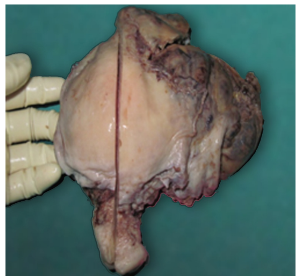
Figure 3: Uterine ruptured at fundus exposing placenta tissue with intact amniotic sac and nonviable fetus in situ.