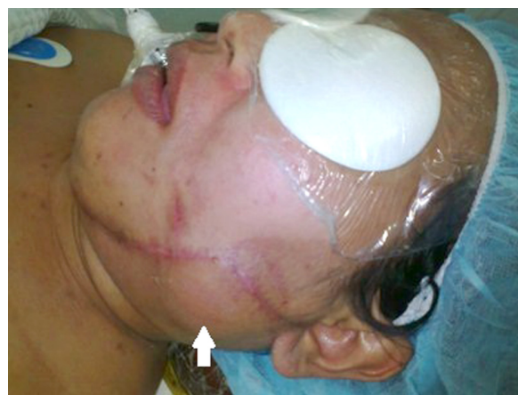
Figure 1: Photograph of the patient showing a laceration scar across the left cheek extending from the left ear to the mandible with a large swelling on the parotid region (white arrow).

A technique of peroral catheter drainage has been previously described, and almost all the authors reported excellent results in their patients (4–7). Demetriades reported the largest series to date, and showed a success rate of 92% in 12 cases (7). In his technique, a small skin incision is made at the facial scar over the sialocoele, through which a small forceps is used to enter the cyst and puncture into the oral cavity. Using the forceps, a catheter is then introduced into the cyst via the oral cavity and secured to the oral mucosa, and the skin incision is closed with a single suture. We used a sinuscopy trocar cannula to puncture the sialocoele from within the oral cavity, which we considered safe for a large palpable cyst like that in the present case. This spared us from an external approach via a skin incision, as sometimes a thick scar and fibrotic tissue may complicate the access into the cyst. Insertion of the drain can be done via the trocar cannula, which is simple and efficient. The drain is anchored in such a way as to allow for better fitting to the buccal mucosa, while at the