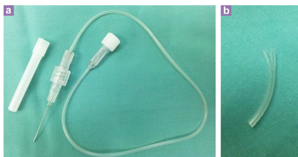
Figure 3: (a) Photograph showing the brachial plexus set. (b) The connector tube is used as a catheter, whereby the tip is cut into a flange and each end is sutured to the buccal mucosa.

same time prevent sensation or interference with chewing.