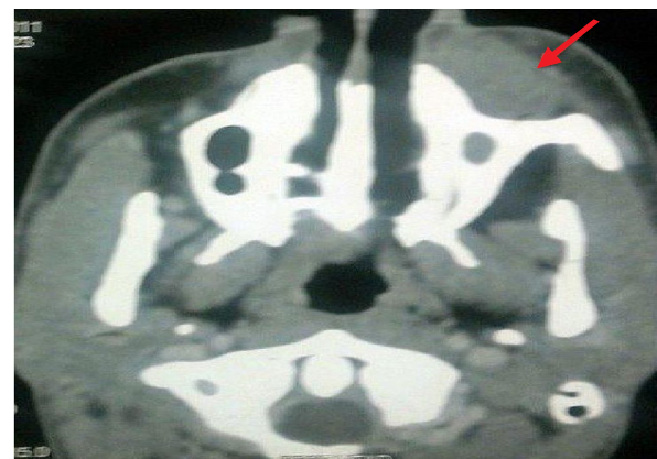
Figure 2: Enhanced axial computed tomography (CT) image showing a mildly enhanced, well-defined soft tissue density lesion anterior to the left maxillary sinus (red arrow), without any evidence of involvement of underlying bone.