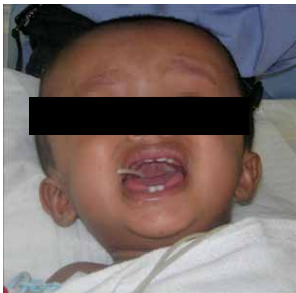
Figure 1: Ventriculoperitoneal shunt tip protruding periorally